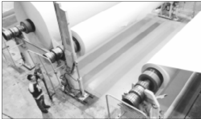
Ontario newsprint mill in action

Over the last few years, the Canadian newsprint and pulp-and-paper sectors have been encountering some difficulties. In the late 1980s and into the '90s, many companies lost money and a number